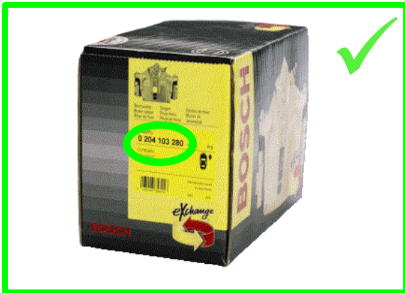
Brake caliper "Back in Box"