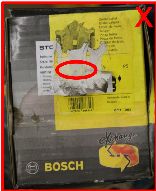
Label covered / damaged / missing → not acceptable