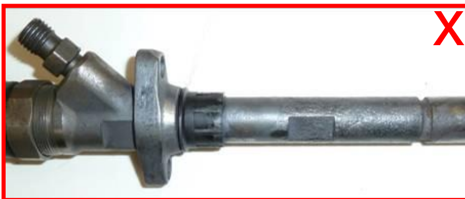
brushed CRI → not acceptable