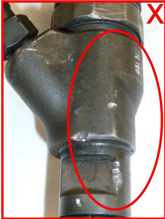
damage on body in terms of deep rabble → not acceptable